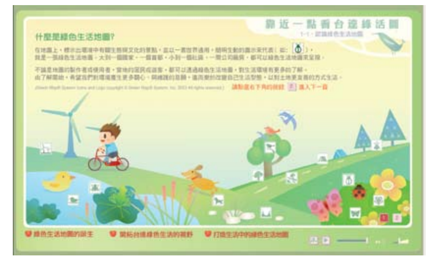
(Above) Delta's interactive online e-learning tool is linked to GreenMap.org/csr

ing building tours on a daily basis. This story is not yet finished. Utilizing the lessons learned from this project, Delta Electronics continuously strives to improve their employees' work environment. More recently Delta has launched an e-learning program that provides new employees the opportunity to learn how to make a Green Map, and bring its positive impacts to their homes.